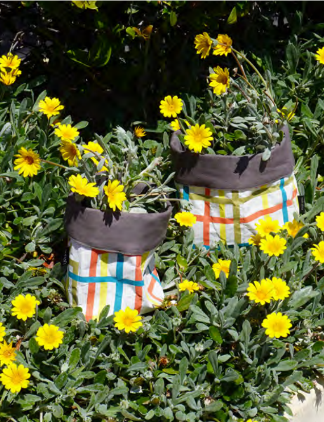
The Promenade Collection

Heather hopes that by drawing attention to these everyday sights, more people will share her enjoyment, and that care will be taken to preserve the character of the buildings along the Sea Point Promenade.